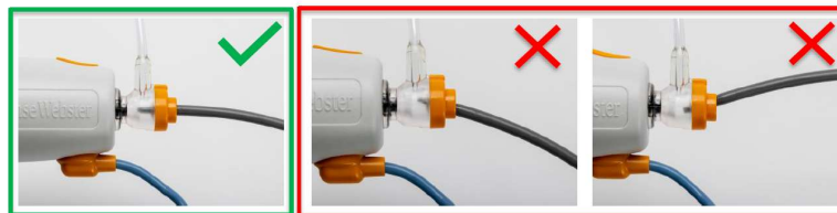
a. Correct dilator insertion